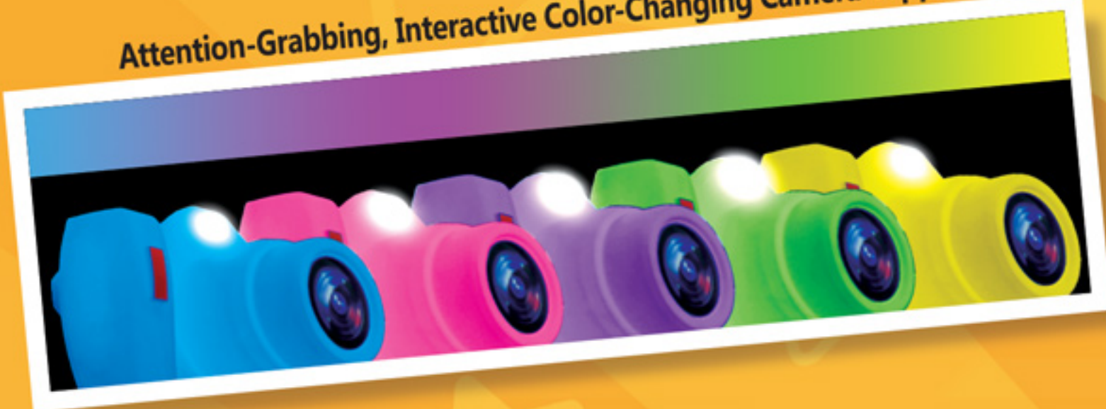
Attention-Grabbing, Interactive Color-Changing Camera Topper