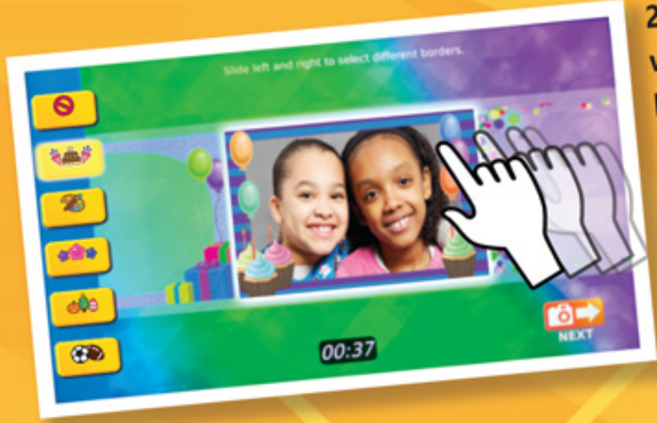
24" HD LCD Touchscreen with Dazzling Graphics! Fun, Easy-to-Use Smartphone User Interface with Interactive Borders and Digital Stickers.