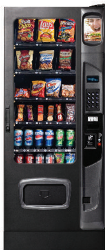
Shown in black door with kick panel option.