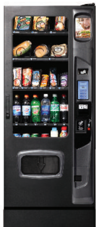
Shown in black with iCart touch screen and kick panel options.