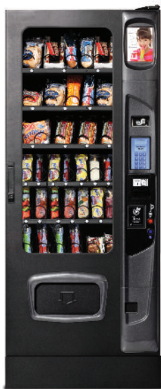
Shown in black with iCart touch screen, delivery assist and kick panel options.