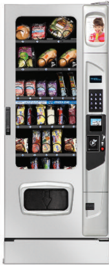
Shown with silver door and kick panel options.