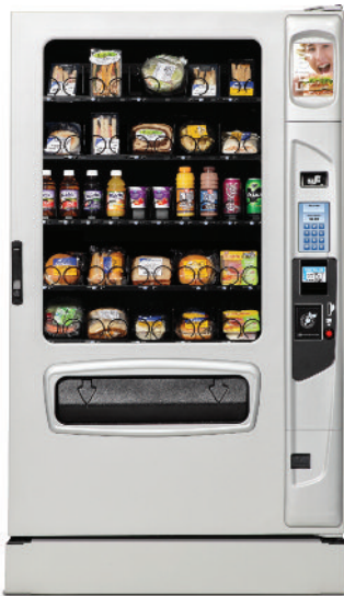
Shown in silver with optional iCart interface & kick panel.