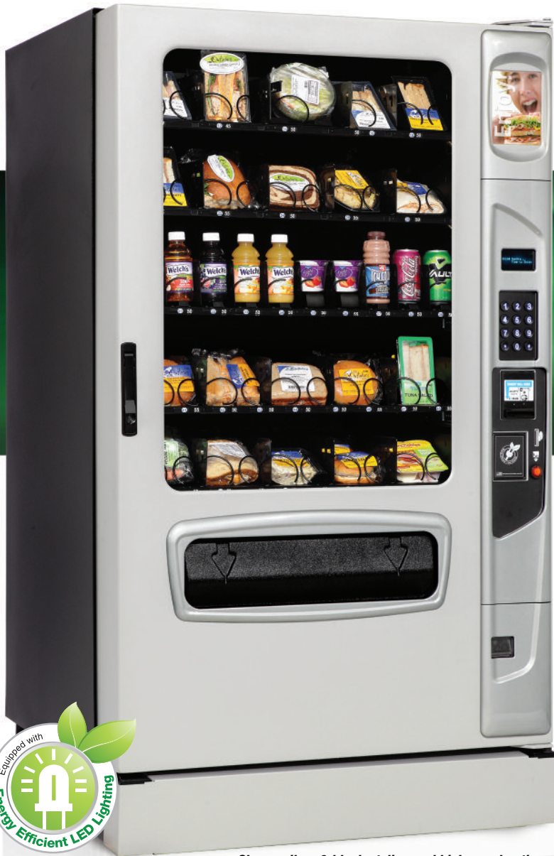
Shown silver & black styling and kick panel options.

The Alpine 5000 Elevator is the latest version of USI's class leading glass front food & beverage merchandiser and is designed to gently serve a wider variety of prepackaged meals, sandwiches, salads, dairy, fresh fruit & beverages.