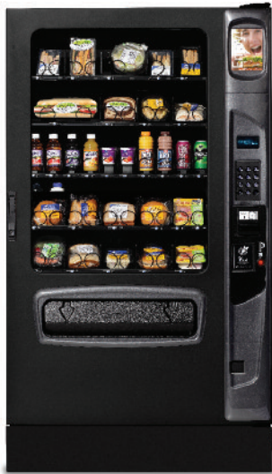
Shown in black with motor pairing and kick panel options.

Note: Not compatible with satellite food or beverage vendors.